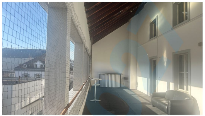
Terrace: 48 sq m

The main entrance is open throughout opening hours